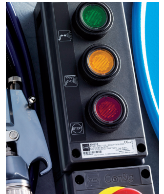
Explosion-proof system remote control