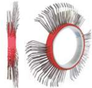
BRISTLE BLASTER® AXIAL BELT, STAINLESS STEEL, 11 MM, LEFT