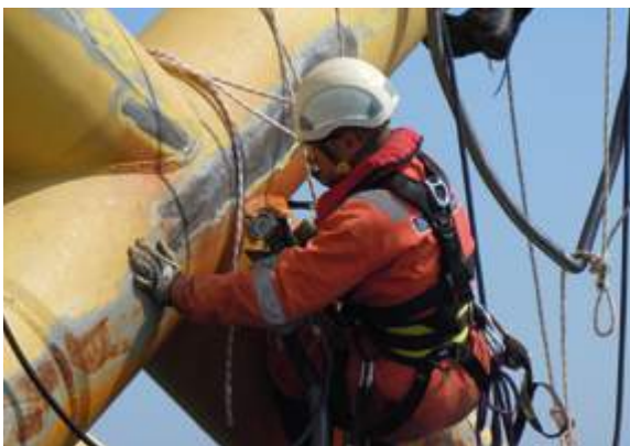
Bristle Blaster® on an offshore platform

Absolutely Gründlich stands for a thorough and sustainable long-term protection of your assets. MontiPower®-preparation from scratch!