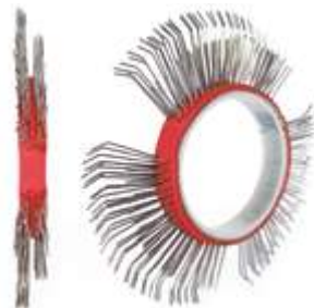
BRISTLE BLASTER® AXIAL BELT, STAINLESS STEEL, 11 MM, RIGHT