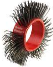
BRISTLE BLASTER® BELT, STEEL, 23 MM