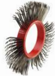
BRISTLE BLASTER® BELT, STEEL, 11 MM