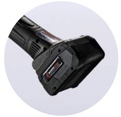
BRISTLE BLASTER® CORDLESS