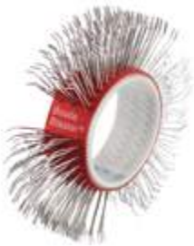
BRISTLE BLASTER® BELT, STAINLESS STEEL, 23 MM