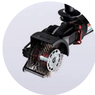
BRISTLE BLASTER® DOUBLE