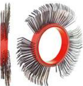
BRISTLE BLASTER® AXIAL BELT, STEEL, 11 MM, LEFT