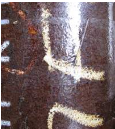
API 5L Piping