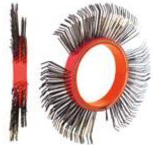
BRISTLE BLASTER® AXIAL BELT, STEEL, 11 MM, RIGHT