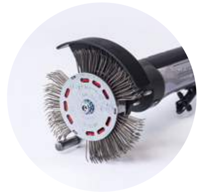
BRISTLE BLASTER® AXIAL