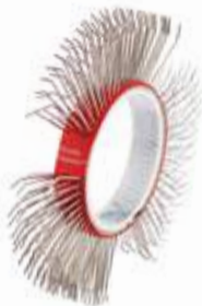
BRISTLE BLASTER® BELT, STAINLESS STEEL, 11 MM