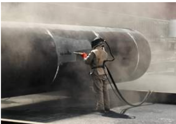
Conventional grit blasting