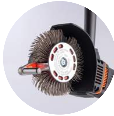
BRISTLE BLASTER® ELECTRIC